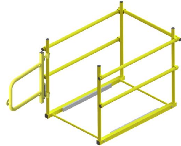
Gate Installed on SHWC 3036 Safety Railing (Railing Sold Separately)

Note: Saf-T-Hatch™ Safety Railing sold separately from gate. See separate submittal.