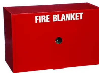
Horizontal Drop Cabinet 9613S21

Surface-mounted tub and solid metal door. The Royal series is available in red epoxy-painted CRS only. Door hardware includes zinc-plated pull handles and roller catches.