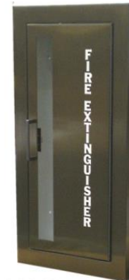
2086V10FX2 US10B Oil-Rubbed Finish with White Vertical Diecut Letters LDCVWFE

All Cabinets Meet 4" Maximum ADA Projection Requirement