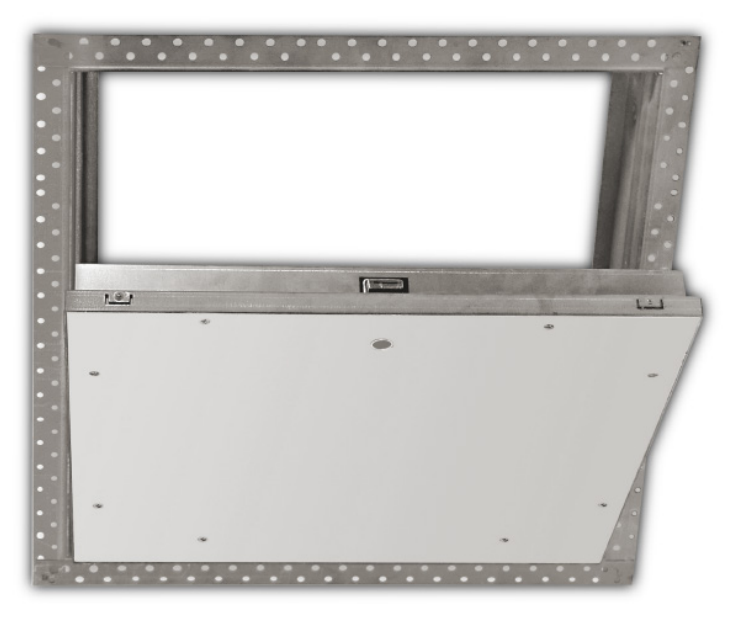
Drywall insert included

Ceiling opening is W+3/8'' ( 9 mm) For detailed specifications see submittal sheet PATENT PENDING