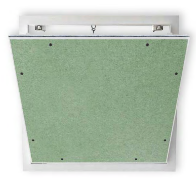
FOR WALL INSTALLATION, HINGE SHOULD BE LOCATED AT BOTTOM

Wall opening is normal door size plus +3/8" (9.5mm) For detailed specifications see submittal sheet