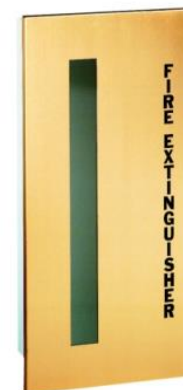
5654V10 Brass With Concealed Pull