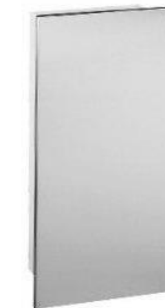
5634S21 Stainless Steel