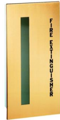
5654V10 Brass With Concealed Pull