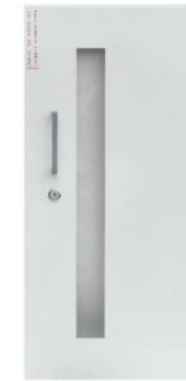
5614W10 Steel with Pull Handle and Saf-T-Lok