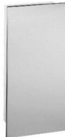
5634S21 Stainless Steel