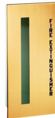
5654V10 Brass With Concealed Pull