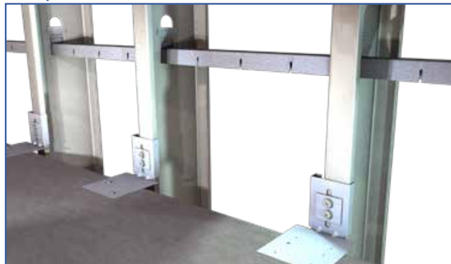
VertiClip SLF used with TSN's BridgeBar® & BridgeClip® installed within 12" from the clip.