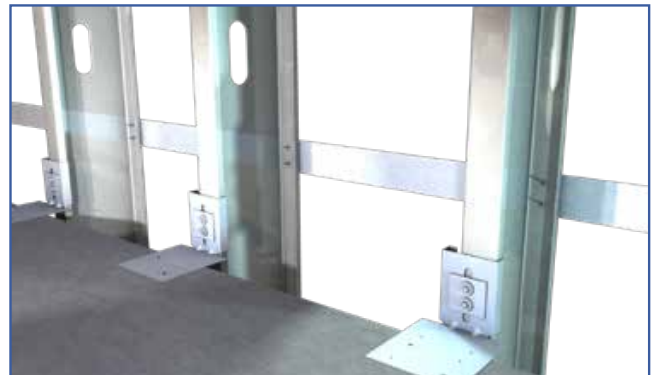
VertiClip SLF used with one flat strap brace on the outer flange of studs to resist torsional effects.