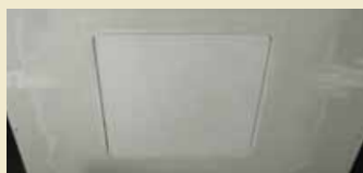
5. Apply desired finish.

Wind-lock What you need. When you need it. www.stealthpanels.com