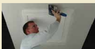
4. Tape and apply drywall compound.