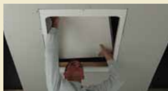
3. Install drywall and place access panel in opening.