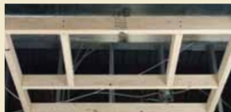
1. Frame the opening.