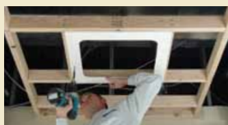
2. Mount Stealth surround with drywall screws.