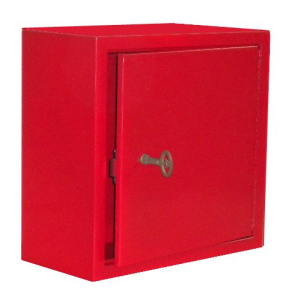
SVC-13 With Optional Color

New_Deeper SFC 11 & 12, SSFC 31 & 32 Cabinet Now Fits 10 lb Cosmic and Galaxy!!