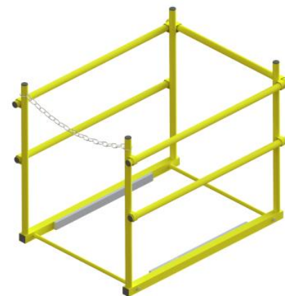
SHWC 3036 RAILING

Installation: Quickly installs by a clamping frame around curb base of roof hatch. Does not penetrate the roof deck or require "approved" installer. Fits all brands of existing roof hatches with curb - field adjustable to fit curb outside size. Railing may also be installed on cap flashing as shown at right.