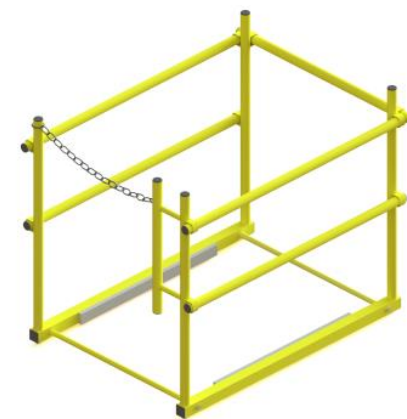
SHWC-3636 SHOWN WITH STANDARD GRAB BAR (Standard with 36" and Greater Egress Side Opening)