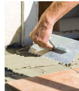
Great under tile