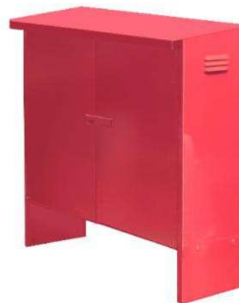
HECIGL OR HECIRL