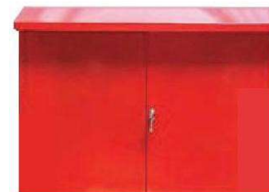
HECIG OR HECIR CABINET W OPTIONAL TOP & BOTTOM LATCHING SYSTEM WITH CHROME HANDLE