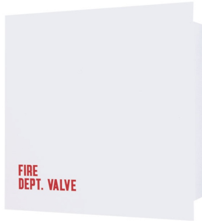
MODEL FRC8220 (Shown)