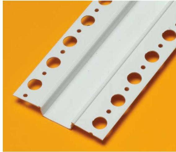
Aesthetic F Reveal also available, please contact Customer Service at (800) 327-7077

Exterior Channel Reveal shall be Plastic Components Inc. #_____. All exterior accessories shall meet ASTM standards D1784, C1063 and D4216, shall be third party tested and Canadian Code Compliant. They shall be used where specified by the design authority and installed per industry standards.