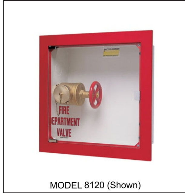
MODEL 8120 (Shown)