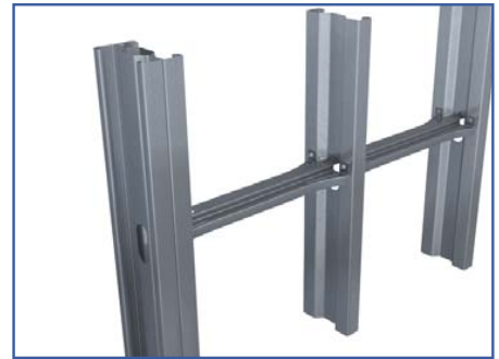
BuckleBridge works just as easily with back-to-back studs.