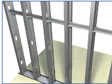
BuckleBridge used in load bearing walls with TSN's SigmaStud