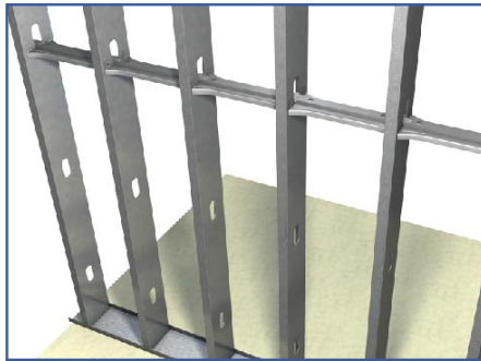
When using BuckleBridge in curtain walls with standard "cee" studs, one screw is only needed every 3rd stud.*