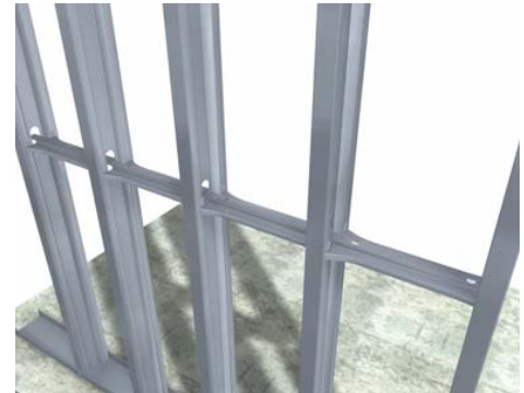
US Patents #7,596,921, #7,836,657 & #8,205,402