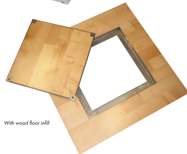
With wood floor infill