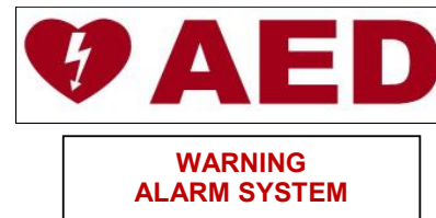
AED Diecut Lettering for S21, L22, F17, G17