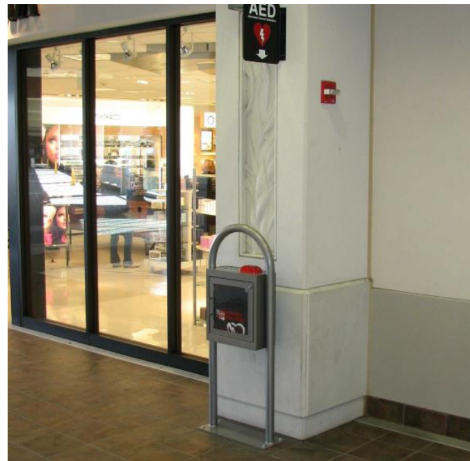
1483F12SASI with Optional Siren Strobe Alarm