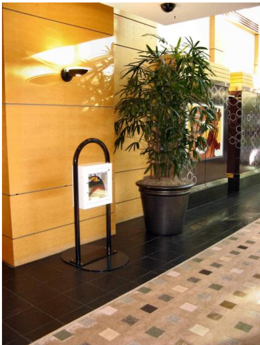
1483 with Optional Black Frame