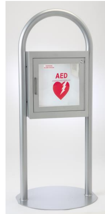
1483F12SI in Silver Finish