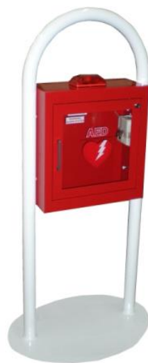
1483 with Optional Red Cabinet/White Frame & Siren Strobe Alarm