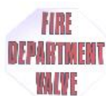
#8 FDVO 6" X 6"