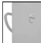
Standard Cam Latch