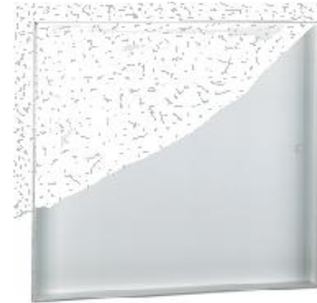
Panel shown as partially-covered by acoustic tile

Sizes: Minimum 6" x 6". Maximum walls—36" x 36", ceilings—24" x 48"