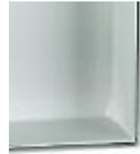
Recessed Door Accepts 1/2" Insert