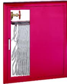
V - Vertical duo panel with pull