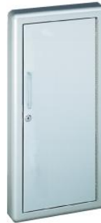
L22 - Solid with pull & Saf-T-Lok®