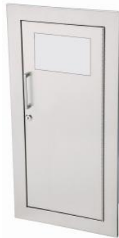
E - Horizontal duo panel with pull and Saf-T-Lok®