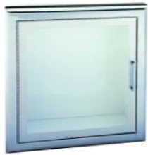
F - Full glass with pull