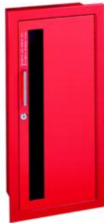
W - Vertical duo panel w/ pull & Saf-T-Lok®