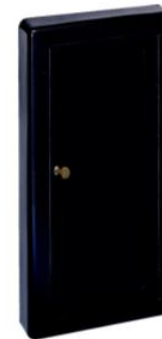
L24 Solid with cylinder key lock & no pull

E.G. L22, W.3 & B10 Door Styles w SAF-T-LOK™