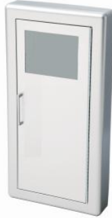
D - Horizontal duo panel with pull