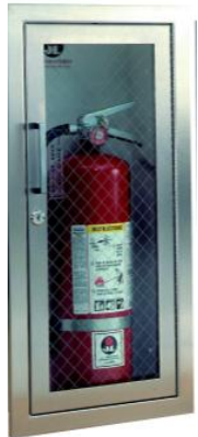
G - Full glass with pull & Saf-T-Lok®