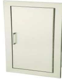
S21 - Solid with pull