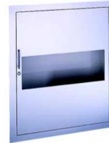
A - Centered Horizontal Panel with Saf-T-Lok®