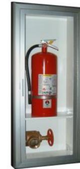
Dual cabinet with shelf - 8000 Series