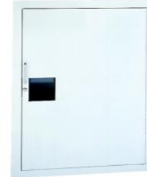
B10 - Solid with pull, view window & Saf-T-Lok®