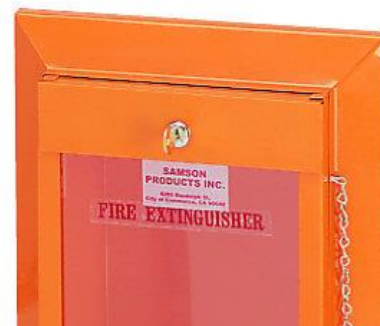
1½" Wide Trim Flange on Recessed Models Optional Orange Color Shown